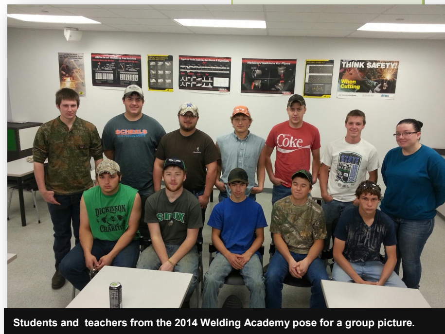
Students and teachers from the 2014 Welding Academy pose for a group picture.

Visit us on the web at www.ractc.k12.nd.us