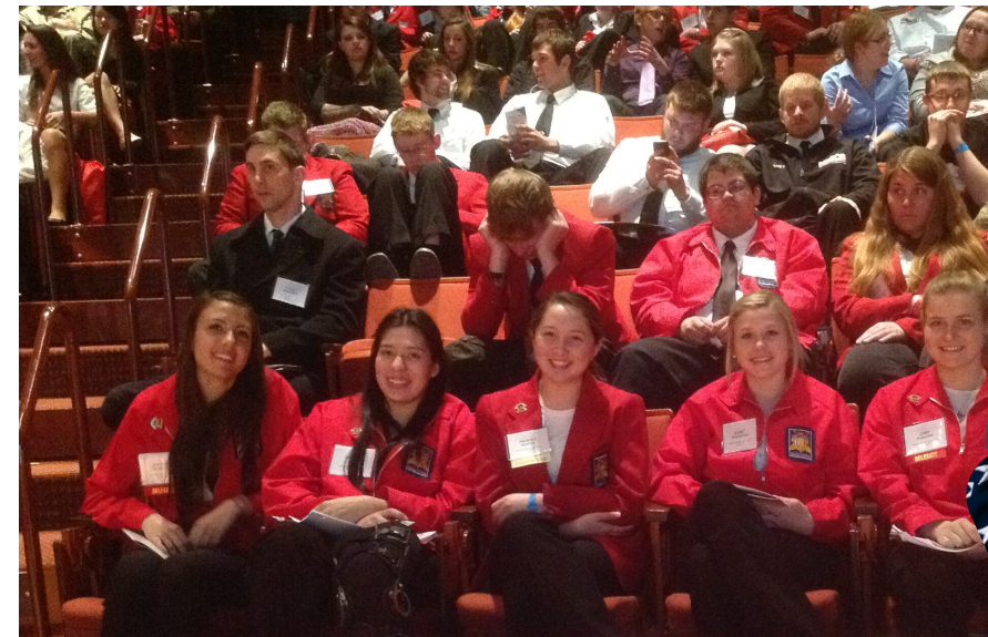
RACTC waiting for the opening session to begin at the spring SkillsUSA Conference in Wahpeton.